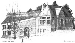
PILLSBURY FREE LIBRARY Warner, New Hampshire